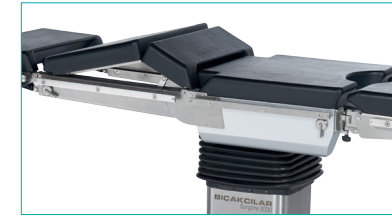
Kidney surgery: Upward 90 mm

Head section: Upward 45°, Downward 60°, Removable Lateral: Right 20°, Left 20° Trendelenburg: 35° Reverse Trendelenburg: 35° Backrest section: Downward 40°, Upward 80° Leg section: Downward 90°, Upward 30°, Spreading 90°, Removable, Independent movement Kidney surgery: Upward 90 mm Reflex: 100° Flex: 220° Horizontal tabletop sliding: 350 mm