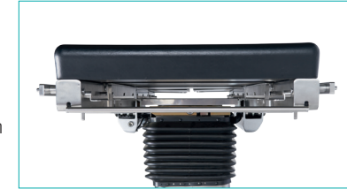
Cassette tunnel w/full length coverage of the tabletop