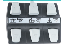
Foot pedal (Optional)