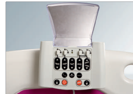
Central control panel (supervisor)