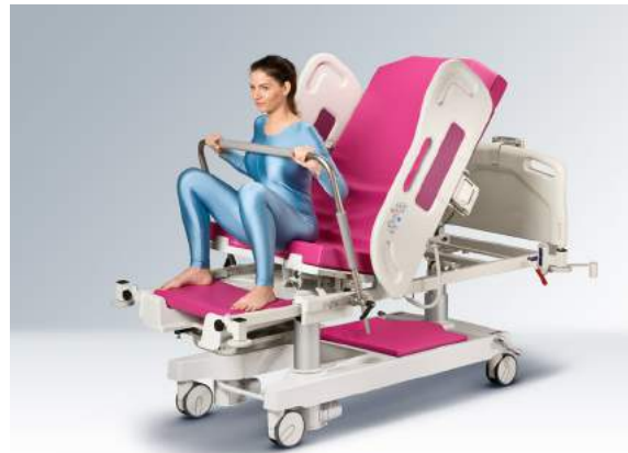
Squatting position with a handle