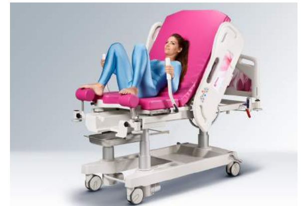
Sitting position with the use of hand grips