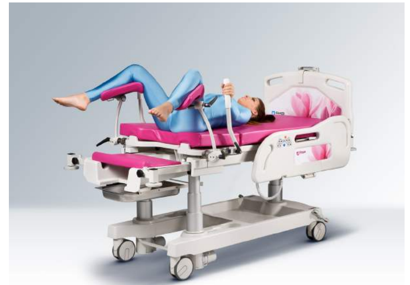
Horizontal position with a mattress for the newborn