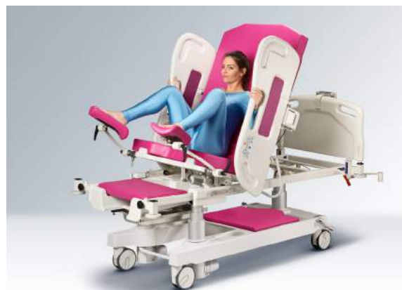
Standard position with feet on the knee rests