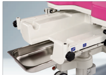
Removable plastic inserts and a basin for body fluids