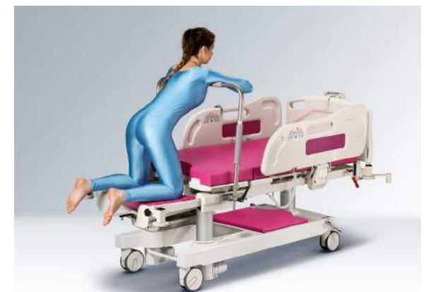
Rear position with a handle