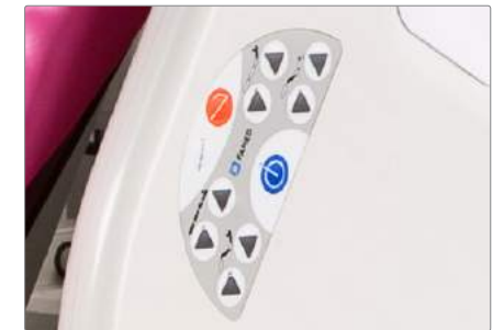
Control panels in side rails