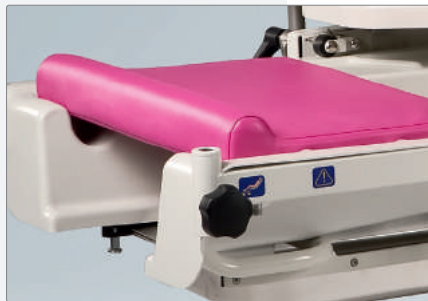
Mattress for newborns