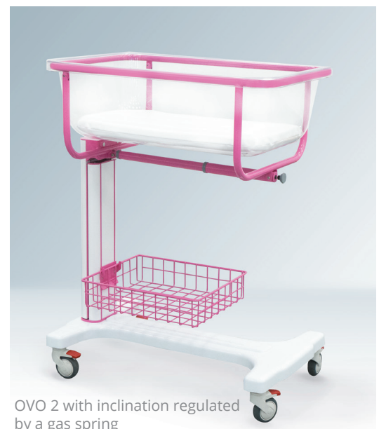
OVO 2 with inclination regulated by a gas spring