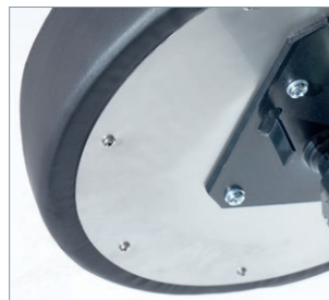
Stainless steel round plate