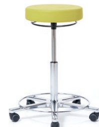
WORK STOOL 54 - 73 cm. Item code 3009105 Chromed foot ring, sitting cushion Ø 36 cm, cover in compact „Citron“ C500, 360° manual ring release, safety castors.