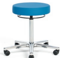
WORK STOOL 40 - 52 cm. Item code 4108105 PREMIUM HO 5-star base polished, sitting cushion Ø 40 cm, cover in premium „Aqua“ P700, 360° manual ring release, safety castors.