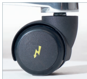
Electrically conductive safety castors, EL 11