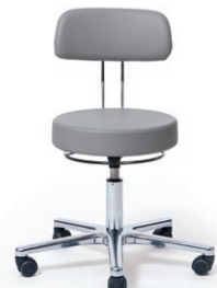
WORK CHAIR 40 - 52 cm. Item code 3018105 5-star base polished, small backrest height adjustable, sitting cushion Ø 36 cm, cover in compact „Stone“ C214, 360° manual ring release, safety castors.