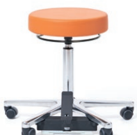
WORK STOOL 46 - 58 cm. Item code 3008205 CENTRAL 5-star base polished with central arrest, sitting cushion Ø 36 cm, cover in compact „Orange“ C530, 360° manual ring release.