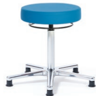
WORK STOOL 54 - 73 cm. Item code 4108305 RG 01 PREMIUM HO 5-star base polished with sliders, sitting cushion Ø 40 cm, cover in premium „Aqua“ P700, 360° manual ring release.