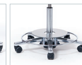
Foot release with foot ring