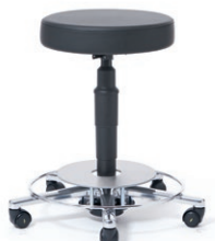
WORK STOOL 51 - 71 cm. Item code 4105305 EL 11 Foot release, sitting cushion Ø 40 cm, cover „Black“ EL 11, gas spring column and safety castors overall electrically conductive.