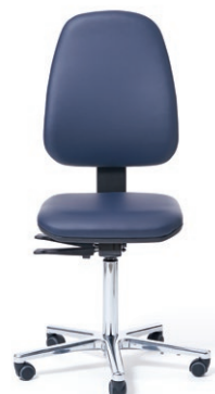
OFFICE CHAIR 54 - 73 cm. Item code 3054600 PREMIUM BS 5-star base polished, backrest adjustable in height and depth with dumping function, without armrest, cover in premium „Navy“ P710, safety castors.