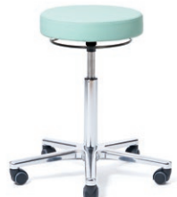
WORK STOOL 54 - 73 cm. Item code 3008305 5-star base polished, sitting cushion Ø 36 cm, cover in compact „Mint“ C450, 360° manual ring release, safety castors.