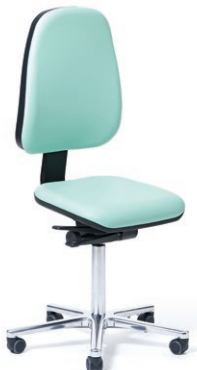
OFFICE CHAIR 54 - 73 cm. Item code 3054600 5-star base polished, backrest adjustable in height and depth with dumping function, without armrest, cover in compact „Mint“ C450, safety castors.