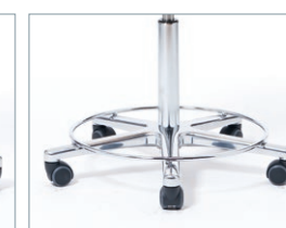
Manual ring release, foot ring