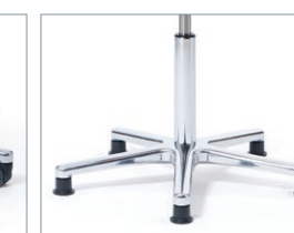
5-star base with sliders