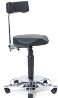
WORK CHAIR 51 - 71 cm. Item code 4185305 EL 11 Foot release, swivelling crescent-shaped backrest height adjustable, anatomically shaped seat edge Ø 40 cm, cover „Black“ EL 11, gas spring column and safety castors overall electrically conductive.