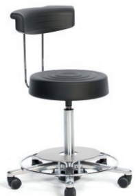
WORK CHAIR 51 - 71 cm. Item code 4015305 Foot release, full foam sitting cushion and crescent-shaped backrest, „Black“, safety castors.