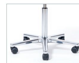
Manual ring release, 5-star base

This is what free choice looks like: The base parts of the GREINER work stools and chairs are characterised by their glossy design, quality and seating comfort. Otherwise, they are rather versatile and tailored to your needs. The foot release developed by GREINER, for example, offers high clinical added value wherever sterile or contaminated gloves are used. Triggered by the round pedal plate attached above the 5-star base, it can be operated "hands-free" all around. All work stools have safety castors, on request as an electrically conductive version.