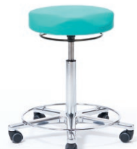
WORK STOOL 54 - 73 cm. Item code 4109105 Chromed foot ring, anatomically shaped seat edge Ø 40 cm, cover in compact „Cyan“ C422, 360° manual ring release, safety castors.