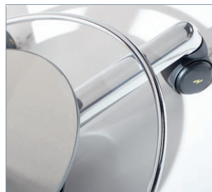
Foot release with foot ring