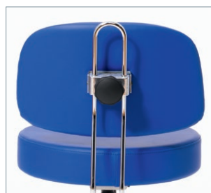
Large backrest from the rear