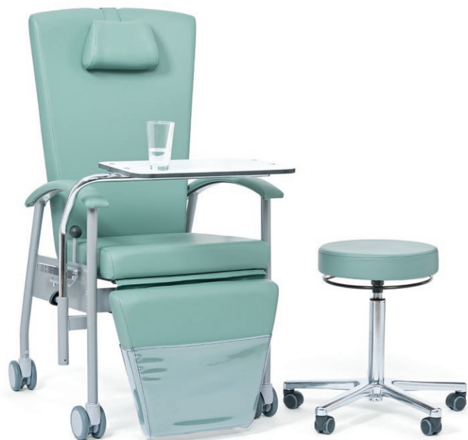
Versatile work stool that suits every treatment chair

Sit like a pro so you can work like a pro. Anatomy, ergonomics and functionality characterise the product design of GREINER's work stools and chairs. Modern sitting comfort not only stands for comfortable upholstery and backrests or smooth-running castors – every functional detail also contributes to an active and ergonomic sitting position.