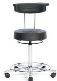
WORK CHAIR 54 - 73 cm. Item code 4019105 Chromed foot ring, full foam sitting cushion and crescent-shaped backrest, „Black“, 360° manual ring release, safety castors.