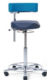
WORK CHAIR 54 - 73 cm. Item code 4185105 PREMIUM AS Chromed foot ring, swivelling crescent-shaped backrest height adjustable, anatomically shaped seat edge Ø 40 cm, cover in premium „Navy“ + „Aqua“ P710/700, manual height adjustment, safety castors.