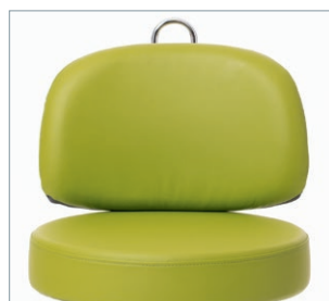
Large backrest front face