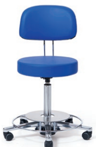
WORK CHAIR 51 - 71 cm. Item code 4155305 Foot release, full foam sitting cushion and crescent-shaped backrest, adjustable, sitting cushion Ø 40 cm, cover in compact „Atoll“ C706, safety castors.