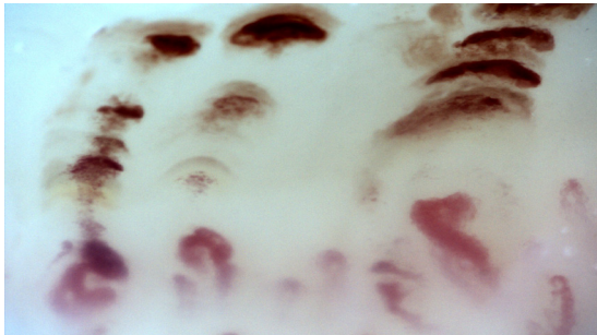
Active Scleroderma Pattern