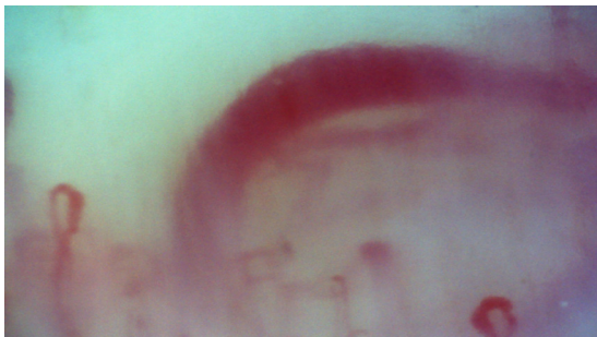
Late Scleroderma Pattern