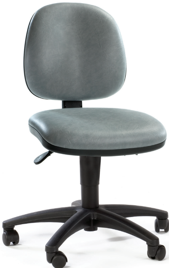
Model ST6100 standard operators chair in Light Grey

Standard Operators Chair High Operators Chair with Foot Support Ring & Glides