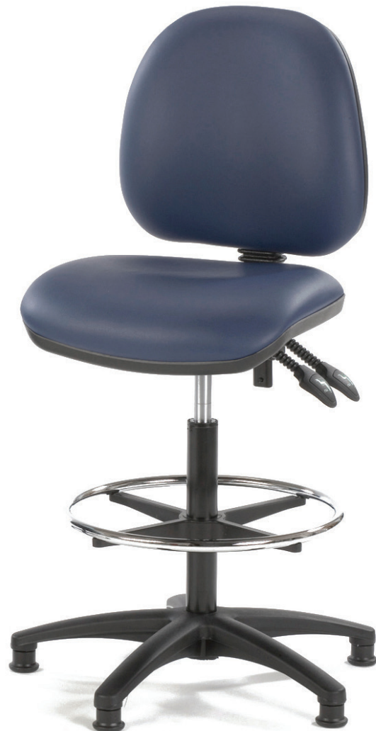
Model ST6101 high operators chair in Dark Blue