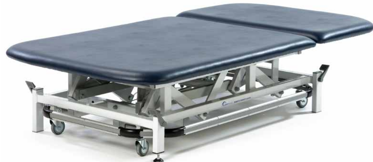
Model ST4562 Shown with optional perimeter foot switch in low patient transfer height.

See page 48-55 for additional information on our range of optional accessories and colour options