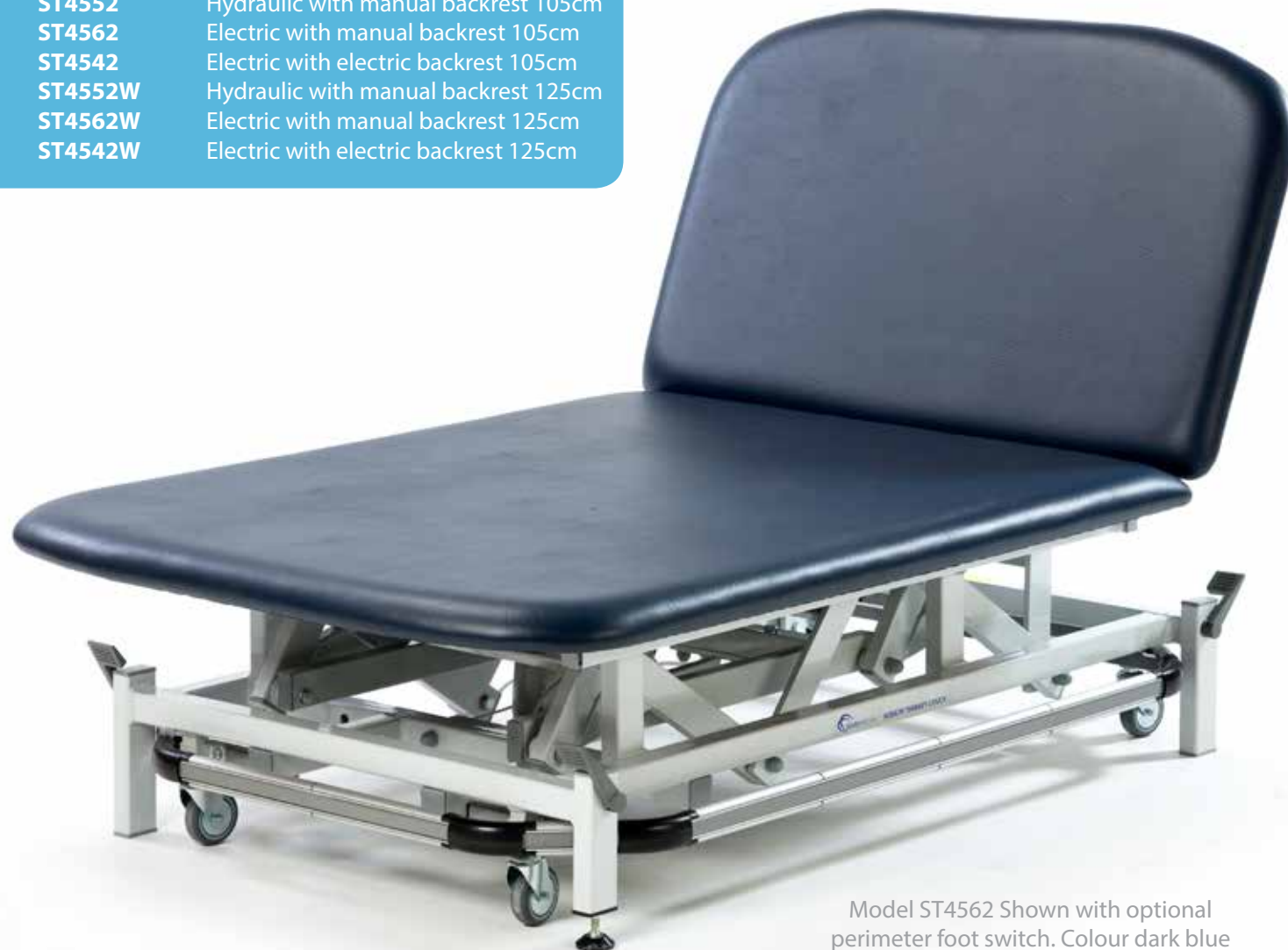
Model ST4562 Shown with optional perimeter foot switch. Colour dark blue