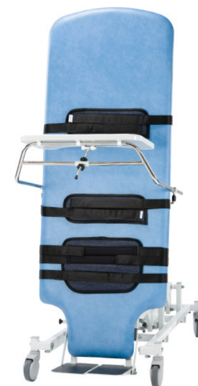
Set of harnesses & worktable included as standard