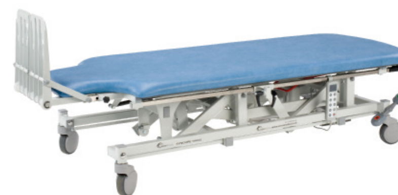
Lowered to minimum height for patient transfer