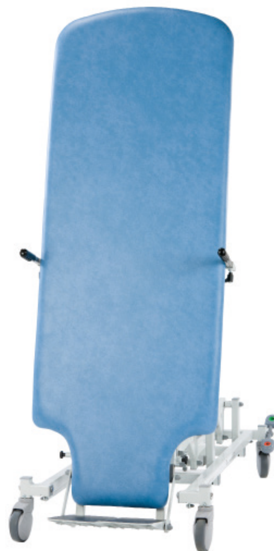
Model ST7645 Colour Sky Blue